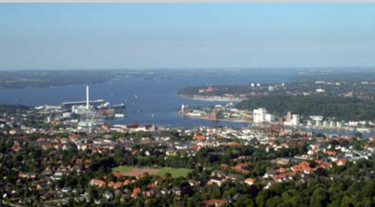
Flensburg, close to the border of Denmark

Europe is growing together most notably at its borders. The proceeding Europeanisation of formerly national policies provides border regions with increasing opportunities to step from national periphery into the European centre. At the same time, border regions serve as testing laboratories for the future of European integration.